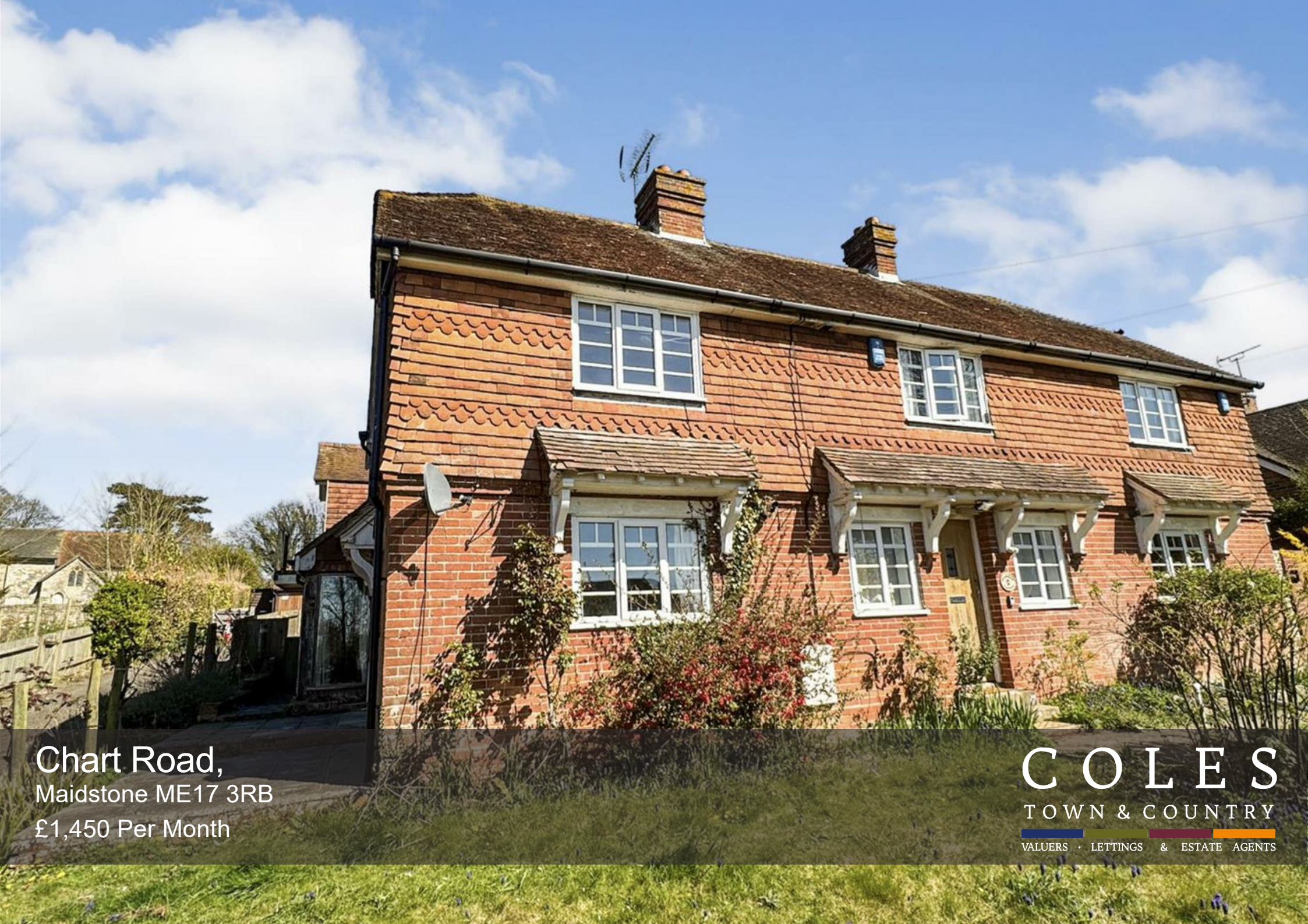
Chart Road, Maidstone ME17 3RB £1,450 Per Month

COLES TOWN & COUNTRY VALUERS • LETTINGS & ESTATE AGENTS